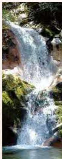
The Ryubi Fall