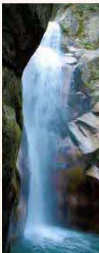
The Ryumon Fall