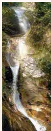
The Touryu Fall