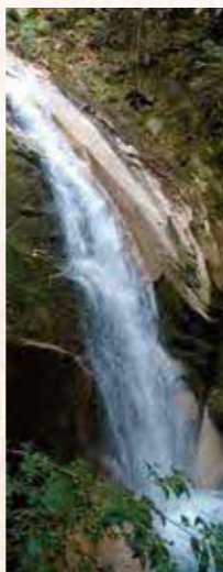
The Hakuryu Fall