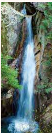
The Ryutou Fall